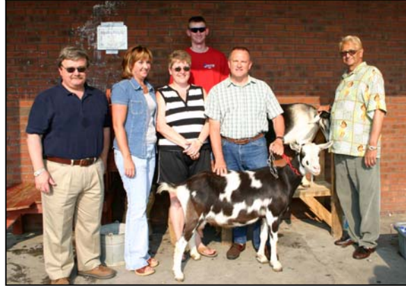
"Dairy Day" pictures

Greene County Pennsylvania "The Cornerstone of the Keystone"