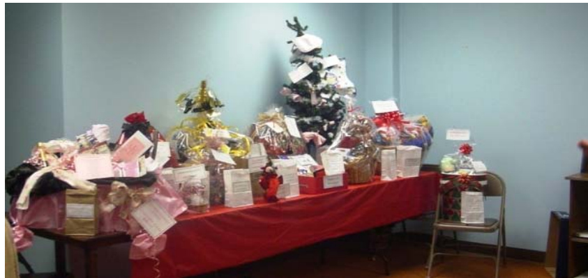
Pictured above: Gift Baskets being raffled

Our "Office Basket Competition - Silent Auction" was a great success, bringing in $808 towards our May 2006 Relay for Life event. I understand that the offices that participated in donating a basket totally enjoyed the experience.