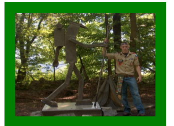
Hiker Statue on the Greene River Trail