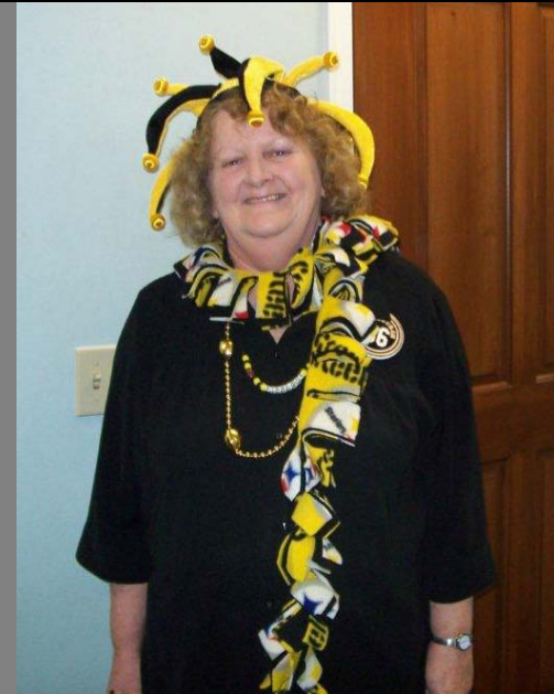
Steelers Fan & Tail-gate volunteer

The Greene County Humane Society accepted donations at the Tail-gate party of its most needed items, including cans or bags of dog and cat food; cat toys and dog chews; gently used sheets, towels, washcloths, blankets, bedding and pillows; clay cat litter; and laundry detergent and dishwashing liquid.