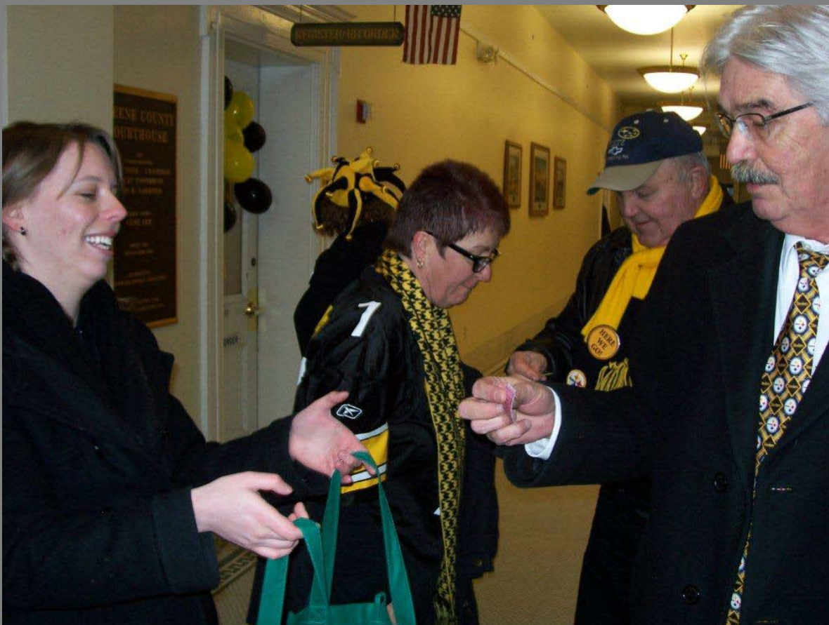
Greene County Commissioners ... reading out the ticket numbers for the 3 basket winners!