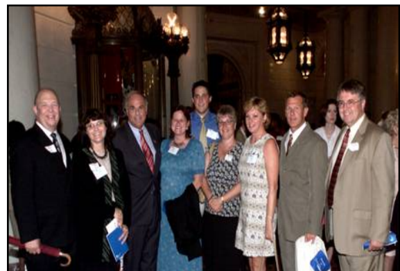
Blueprint Communities Presentation Pennsylvania State Capitol...August 9, 2005